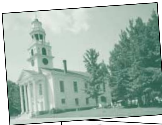
Measured drawings (one shown at right) and photographs (example above) of Old South Congregational Church, Windsor, were taken in 1959 by the Historic American Buildings Survey.

It is easy to think that Alexander Twilight, the pioneering African-American educator and minister buried in the Brownington churchyard, would approve.