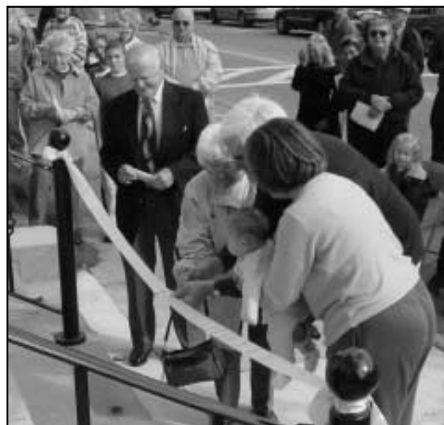
Old South's oldest and youngest members cut a ribbon to dedicate the church's reconstructed steps.

From Partners' point of view, the cooperation between the statewide preservation organization and the denominational office is the fruit of years of work — precisely the cross-pollination that New Dollars fosters nationwide. Thus, in a remote area like Vermont's Northeast Kingdom, leaders in preservation and architecture, on the one hand, and those in